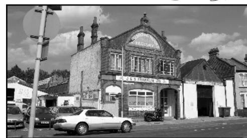
Old Walbrook Works factory

The area in Norlington Road outside the old Walbrook factory has been a hot spot for what looks like fly-tipping for some time. Focus says: The Council's response is that the bulky waste comes from the people who live and work in the factory and is not classified as fly-tipping. They say that the owner of the premises clears it up quickly. Local residents seem to have a different view.