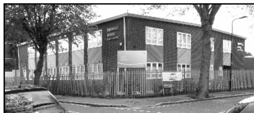
Triangle Health Centre

Focus says: This is a new NHS service following the closure, in September, of the walk in service in Oliver Road , Leyton.