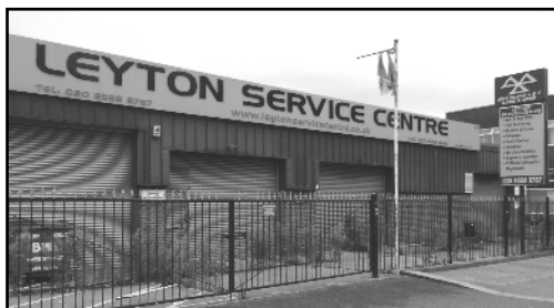
Leyton Service Centre - yet more flats

It seems the Council can't wait to give developers permission to build more expensive flats that local people cannot afford.