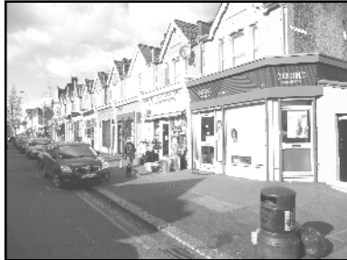
Parade of small businesses in Francis Road

A petition has been submitted to the Council by residents and businesses in Francis Road opposing the 'Mini Holland' scheme planned for Francis Road . They say that the ban on vehicle access between Claude Road and Albert Road is ill conceived with little consideration given to the implications on businesses and residents, particularly in regard to access and parking.