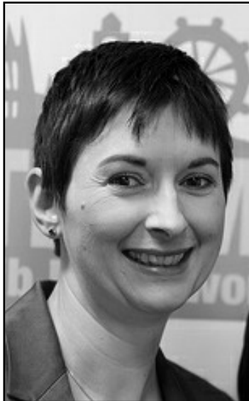
Lib Dem Mayoral candidate Caroline Pidgeon

Caroline Pidgeon, the Liberal Democrat candidate for Mayor of London, set out plans for half price fares on Underground, DLR, Overground and TfL Rail services for people who start their journeys before 7.30am.