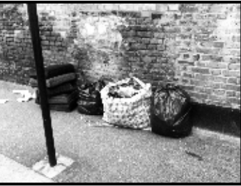
Dumped rubbish reported by the Focus Team

The dumping of rubbish is not just in Albert Road which we have reported, but across Leyton.