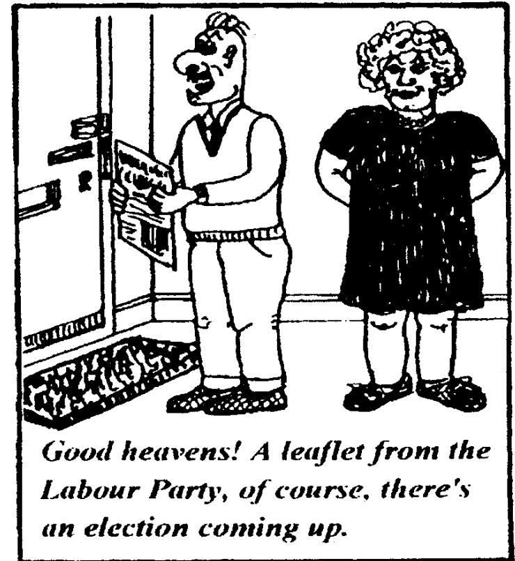
Good heavens! A leaflet from the Labour Party, of course, there's an election coming up.

will then decide which roads will be consulted about a CPZ. Focus will keep you informed of developments.