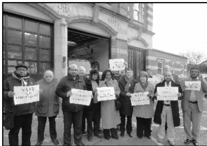
Lib Dems launching their petition at Leytonstone Fire Station some months ago

The grass fires in Leytonstone emphasised why we need our local fire engines to stay and not to be cut back. Recently Lib Dems along with other elected members of the London Fire Authority voted once again to reject the widespread closure of fire stations being pushed forward by the Mayor Boris Johnson. The plans included removing one engine from each station in Leytonstone, Leyton and Chingford.